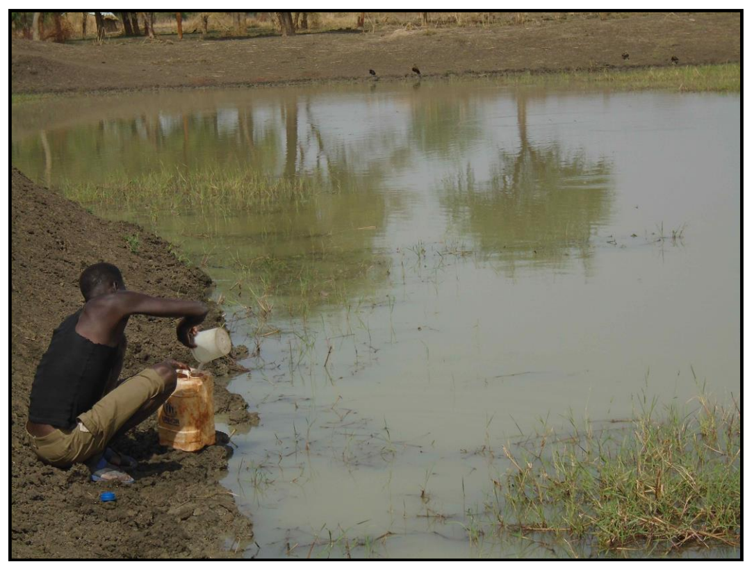
Picture 2: Shallow well used for drinking water in Jamjang, Unity State

the nearest town with decent water access.<sup>54</sup> Some communities also dig extra wells, and in Upper Nile water is transported from Renk town in tanks using horses and donkeys.<sup>55</sup>